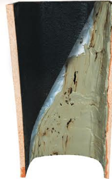
PCR applied to half of the flue tile