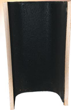
3 rd degree glazed creosote on flue tile

PCR is the answer to the recurring (and dangerous) problem of massive creosote buildup in flue tiles and stainless steel chimney liners. Since the invention of chimneys, this accumulation has proven to be stubborn and difficult to remove...until now.