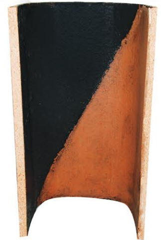
Completely restored flue tile