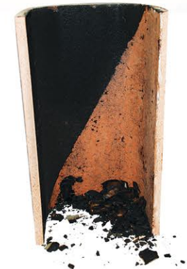
Creosote falls off easily as PCR dries